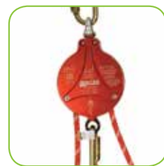
Backup Braking System included in Premium Kit

Best choice for users whose job does not normally include rescue