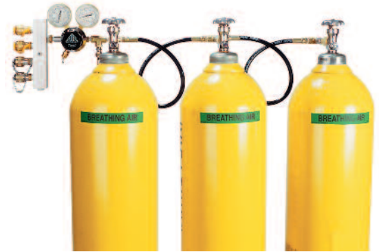
CBA3-346NB Cylinders Not Included

Additional Breathing Air Assemblies Available. Contact Our Customer Service Department.