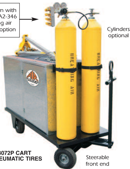
CSC-3072P CART WITH PNEUMATIC TIRES

Cart shown with Model CBA2-346 breathing air assembly option