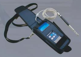
Hands-free Case now available!