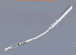
Telescopic, articulating probe