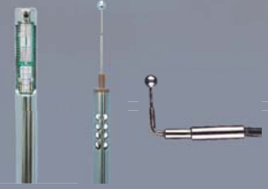
Expanded Seven Air Velocity Probe Line-up