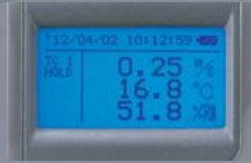
LCD display with bright backlight